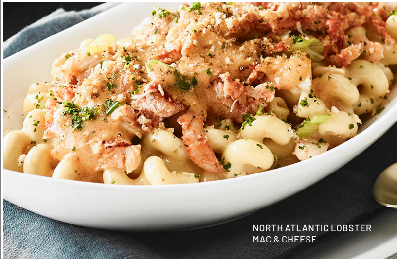
NORTH ATLANTIC LOBSTER MAC & CHEESE

tender lobster, cavatappi, smoked cheddar, chipotle panko breadcrumbs 1310 cal