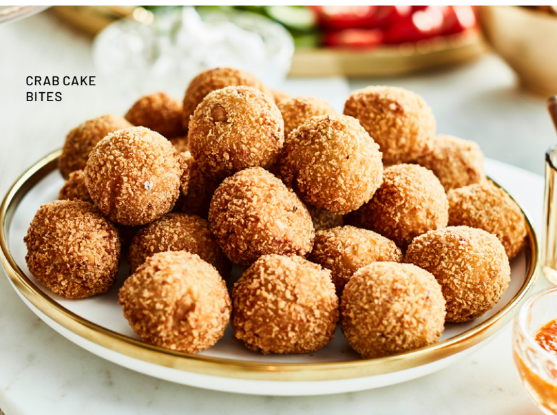
CRAB CAKE BITES