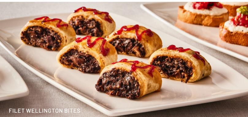
FILET WELLINGTON BITES

CHICKPEA EGGPLANT VEGAN CAKES Romesco, arugula, pickled red onions, agave lime vinaigrette 113 cal | 4