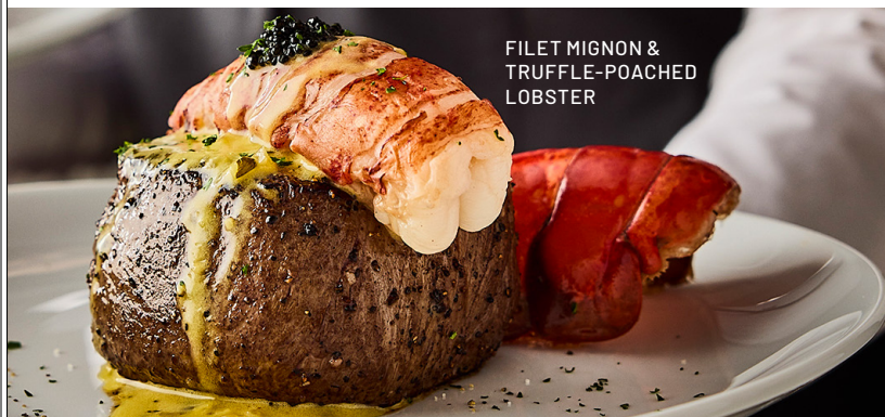
FILET MIGNON & TRUFFLE-POACHED LOBSTER