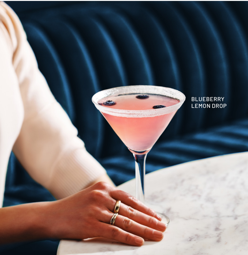
BLUEBERRY LEMON DROP

Basil Hayden's bourbon, orange peel, maple syrup, a dash of black walnut bitters & fresh rosemary