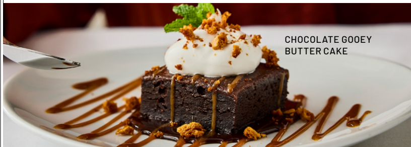
CHOCOLATE GOOEY BUTTER CAKE

CHOCOLATE GOOEY BUTTER CAKE honeycomb brittle, chocolate sauce & caramel 780 cal