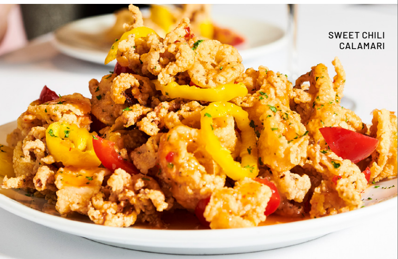
SWEET CHILI CALAMARI

lightly breaded, tossed with sweet chili sauce 850 cal