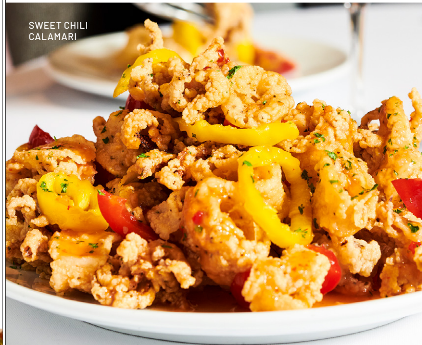
SWEET CHILI CALAMARI