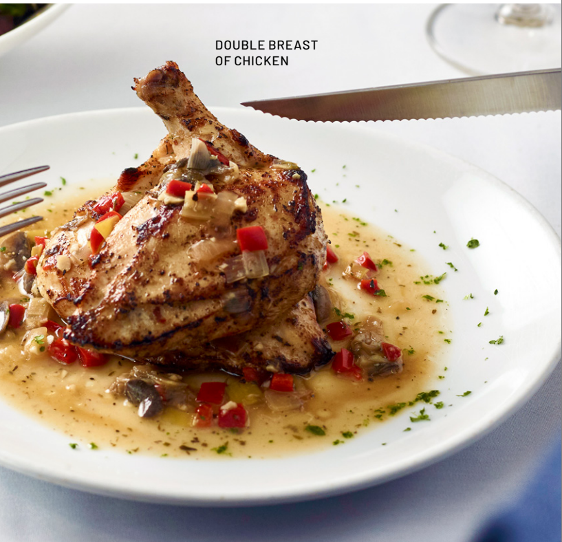
DOUBLE BREAST OF CHICKEN

TOMATO BASIL SOUP whipped burrata cream, basil oil & crostini 150 cal