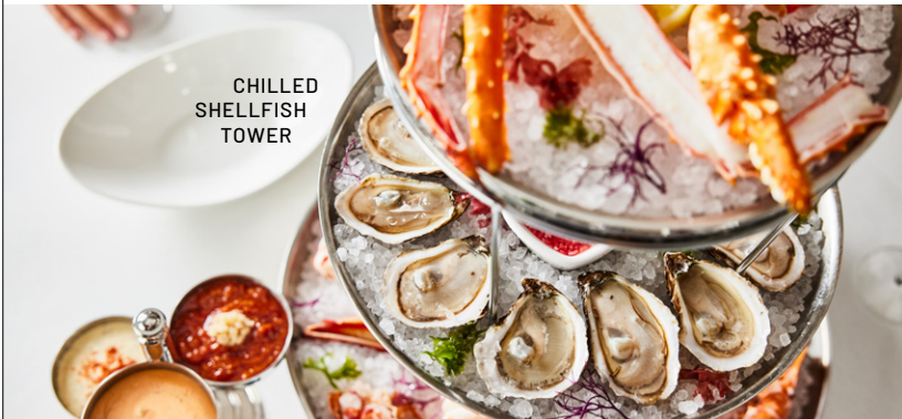
CHILLED SHELLFISH TOWER

FILET WELLINGTON BITES* Crispy puff pastry, mushroom duxelle, parmesan, melba sauce 297 cal